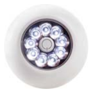
LED (Battery operated)

Our units are manufactured from rugged Fortiflex ® High Density Polyethylene and are UV protected.