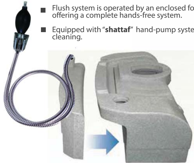
Fresh water tank