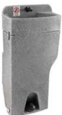
SIERRA FOREARM 21 Gallon / 79 L