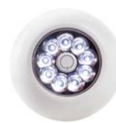
LED (Battery operated)

Our units are manufactured from rugged Fortiflex ® High Density Polyethylene and are UV protected.